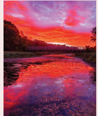
Second Place: Spring Sunrise at Minnehaha Creek