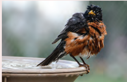
Winner: Angry Bird with Ruffled Feathers