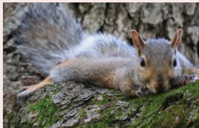
Third Place: Untitled