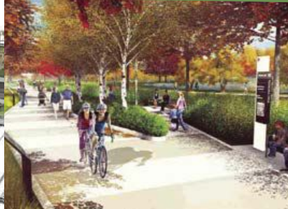
Ridgedale Area Public Realm Guidelines