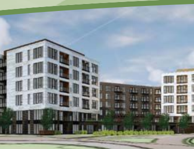
Ridgedale Active Adult Apartments