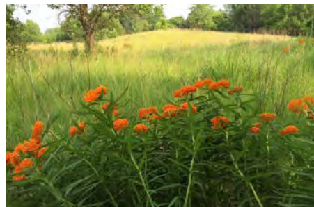
Resilient Minnetonka provides resources and technical landscaping assistance.