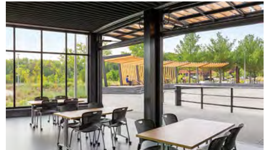
Ridgedale Commons is Minnetonka’s newest city park.