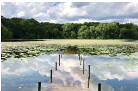
A climate action plan will set strategies to better prepare for extreme weather events and reduce greenhouse gases.

The community is developing strategies and resources to help prepare for, recover from and thrive in a difficult and changing climate. More than 1,000 participants provided feedback for Minnetonka’s Climate Action and Adaptation Plan.