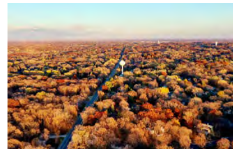
Minnetonka is developing a plan to evaluate the health of trees across the city and plan for the future of our community forest.