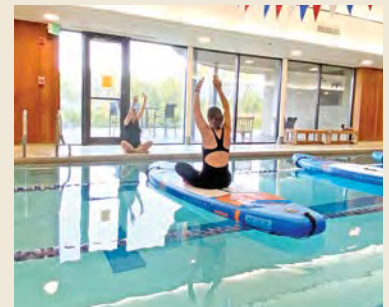
The city successfully acquired and reopened The Marsh fitness and wellness center.