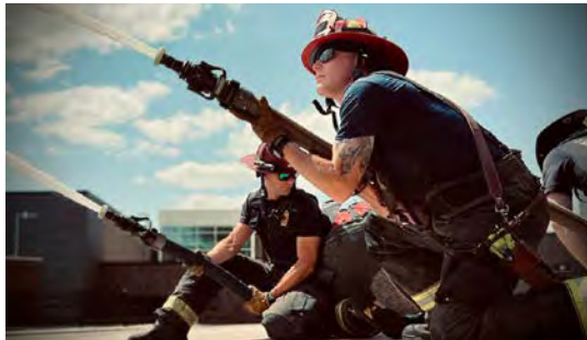
90 percent of residents surveyed rate the quality of city services as good or excellent.