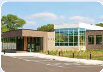
Minnetonka Fire Station 1 14550 Minnetonka Blvd.