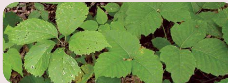
Virginia creeper (left) vs. Poison ivy (right)