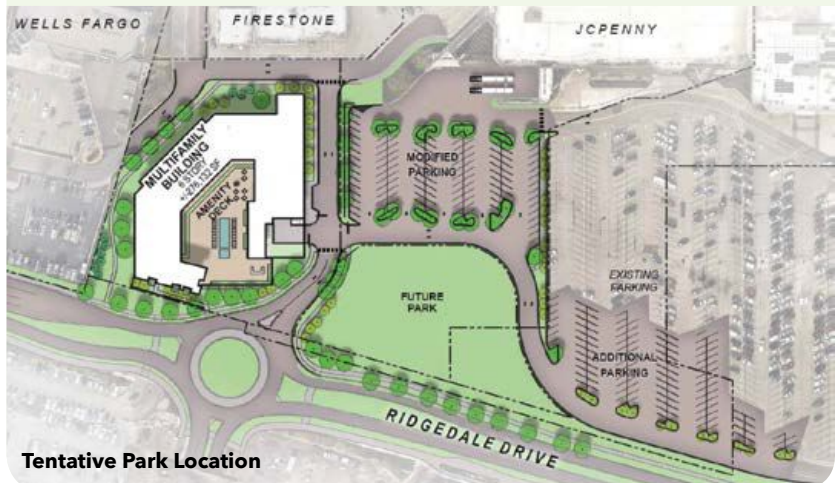
Tentative Park Location

After you've completed the questionnaire, don't forget to sign up for email or text notifications about the project on our website.