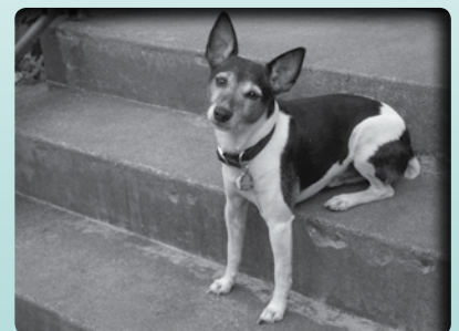
Melanie Ebert, “Buddy Long Legs” (2010 Photo Contest Entry)

SEE PAGE 7 FOR ALL THE DETAILS on this year’s photo contest. ☺