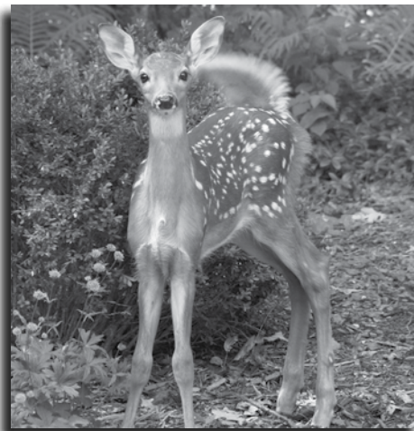
Dave Wiemer, Bright Eyed and Bushy Tailed (2010 Photo Contest Entry)

For more information visit http://www.myminnesotawoods.umn.edu/2009/12/tree-stem-protection/ ☺