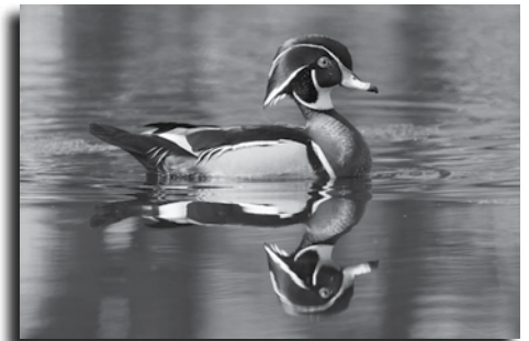
Jim Stroner, "Wood Duck Reflection"