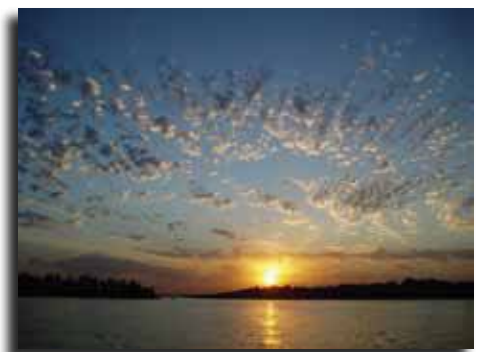
Third Place: Je Kirby, "Fingerpainting with Clouds"

See page 2 for more photo contest winners.