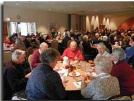
Enjoy a Thanksgiving feast November 15.

Turkey, stuffing, mashed potatoes, gravy, corn, cranberries, dinner roll and pumpkin dessert. Cost is $7, due by Nov. 8.