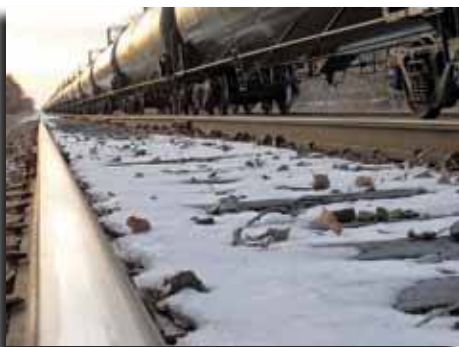
Honorable Mention: Abigail Key, "I've Always Wanted to Travel"