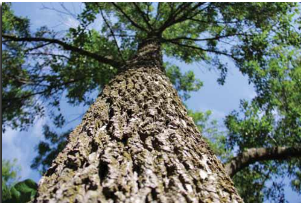
2011 Photo Contest: Lia Harel, "Looking Up"