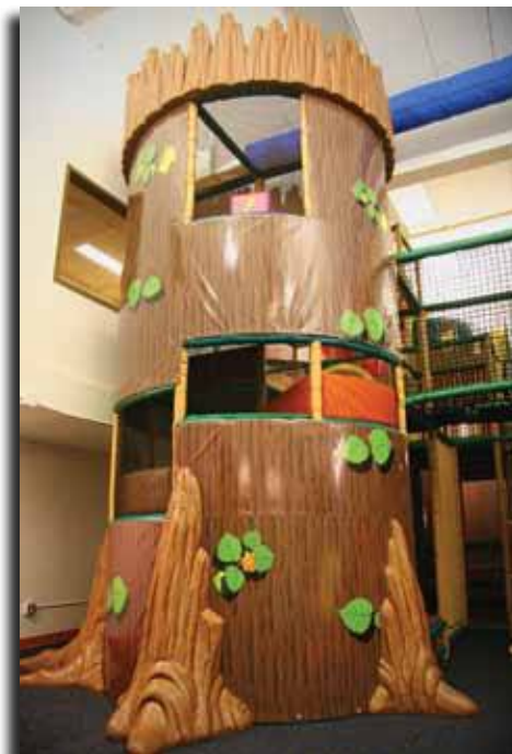
Weather becoming frightful? Take the kids to the indoor play structure at Williston!

The Williston Fitness Center is located at 14509 Minnetonka Drive, Minnetonka. Call (952) 939-8370 for more information.