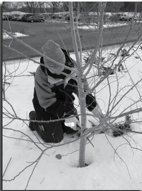
Learn to prune trees January 29.

This workshop is being held earlier in the day to allow for daylight during the outdoor pruning demonstration. Please RSVP by calling Minnetonka Public Works at (952) 988-8400.