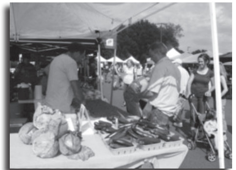
Customers browsing at the Minnetonka Farmers' Market, Tuesdays, 3 - 7 p.m.