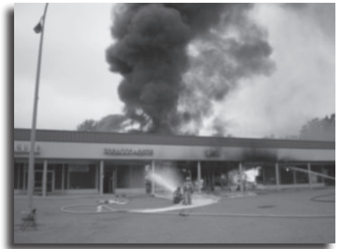
The Minnetonka Fire Department responded via mutual aid to a May mall fire in Hopkins.

Significant events included structure fires on Eastwood Road, Hedberg Drive, Lake Street Extension, and Plymouth Road; an apartment fire on Cedar Hills Boulevard; mutual aid to Hopkins for a commercial mall fire; a water rescue on Gray's Bay; and a carbon monoxide incident at an Atrium Way condominium building.