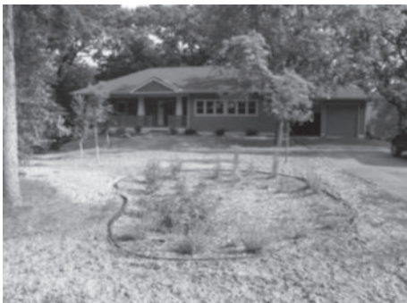
The recently constructed green home on Minnetonka's Spring Lane.

The city plans to put the house up for sale sometime this fall. ♪