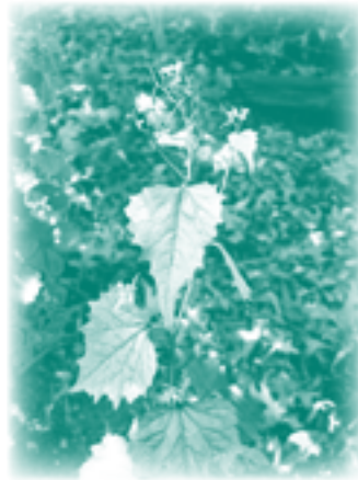
Garlic mustard, a non-native species introduced to the United States in 1868.