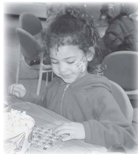
Bingo and face painting were popular activities at last year’s Kids’ Fest.

Proceeds from concessions sales will be donated to the Richard Wilson Recreation Services Scholarship Fund. A shuttle will run between all three facilities for ease of transportation. For more information, please see the winter/spring recreation brochure or call (952) 939-8203. □