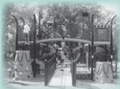
Summer program participants enjoy new play equipment at Meadow Park.

Planning is completed, with construction work to be scheduled around summer day camp.