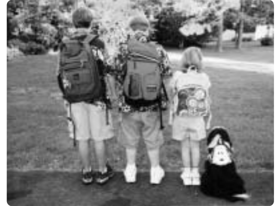
Cindy Schaefer's photo "Back to School" took first place honors in the 2003 City of Minnetonka Photo Contest.

Any submitted photos become the property of the City of Minnetonka and may be used in city publications with proper credit. The city will not be responsible for lost entries. The photographer is responsible for obtaining approval from identifiable people in a photo taken in a non-public space.