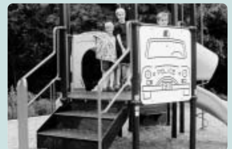
Neighborhood residents participated in planning Sunrise Ridge Park.

M INNETONKA'S NEWEST PARK, Sunrise Ridge, Minnetonka Drive at Sunrise Drive, was officially dedicated July 10. After petitioning the city council for a playground for neighborhood children and receiving approval, residents were actively involved in planning the park and in selecting play equipment. □