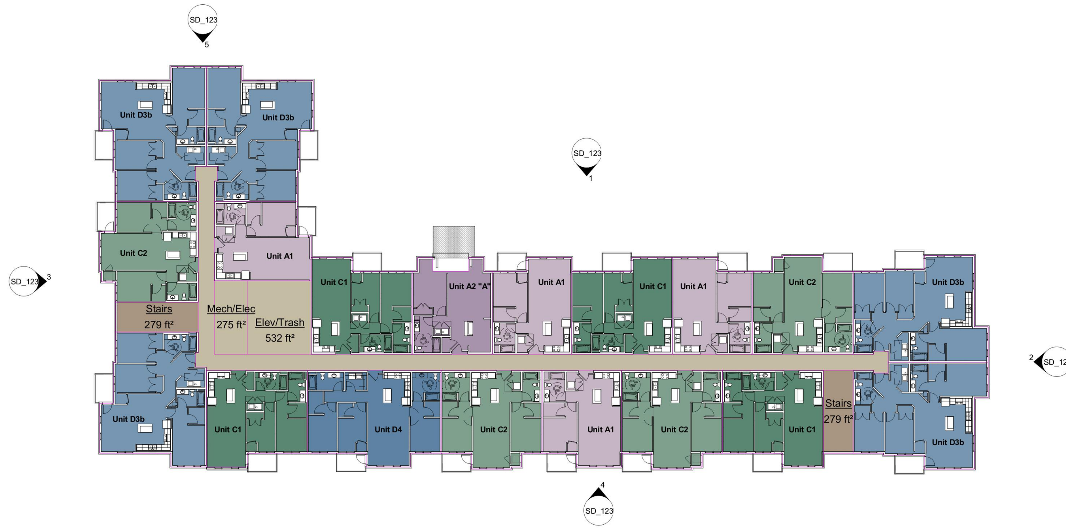
① Level 2 1" = 20'-0"