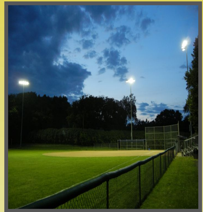
Glen Lake Park (2006, 2007)