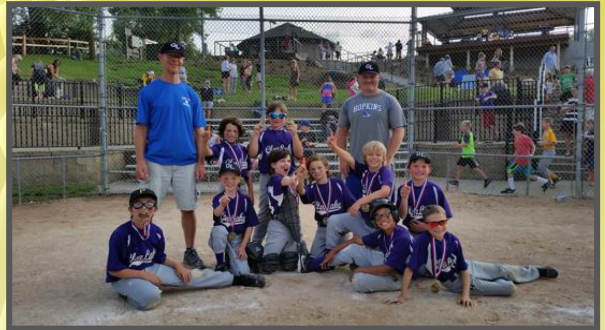
Glen Lake Mighty Mites