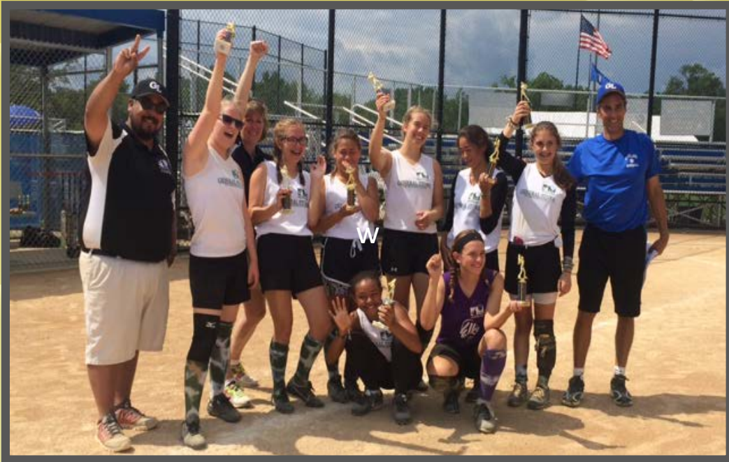
Glen Lake Girls Athletic League