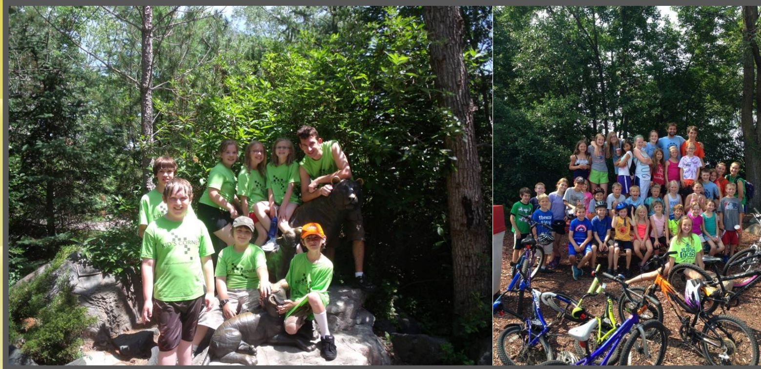
Summer Playgrounds – Glen Lake Elementary