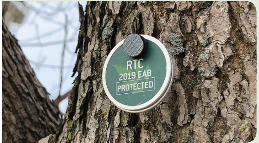
Ash tree with injection tag

Injection treatments significantly reduce the risk of emerald ash borer (EAB) and Dutch elm disease (DED). This is especially important now that EAB has been found in several Minnetonka neighborhoods. Contact Rainbow Treecare (952-922-3810) to request the city's bulk discount, or contact an arborist of your choice.