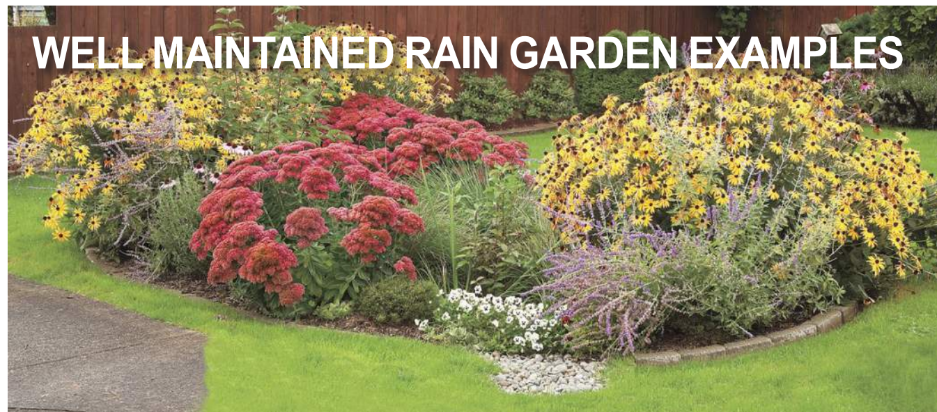
WELL MAINTAINED RAIN GARDEN EXAMPLES

As a homeowner in the project area, the City of Minnetonka is offering the opportunity for you to voluntarily help with improving the stormwater quality within and beautification of your community. Residents may 'opt in' to a program where the City will install a rain garden on or adjacent to your property as part of the project at upfront City cost. Property owners would be responsible for maintenance of the rain garden.