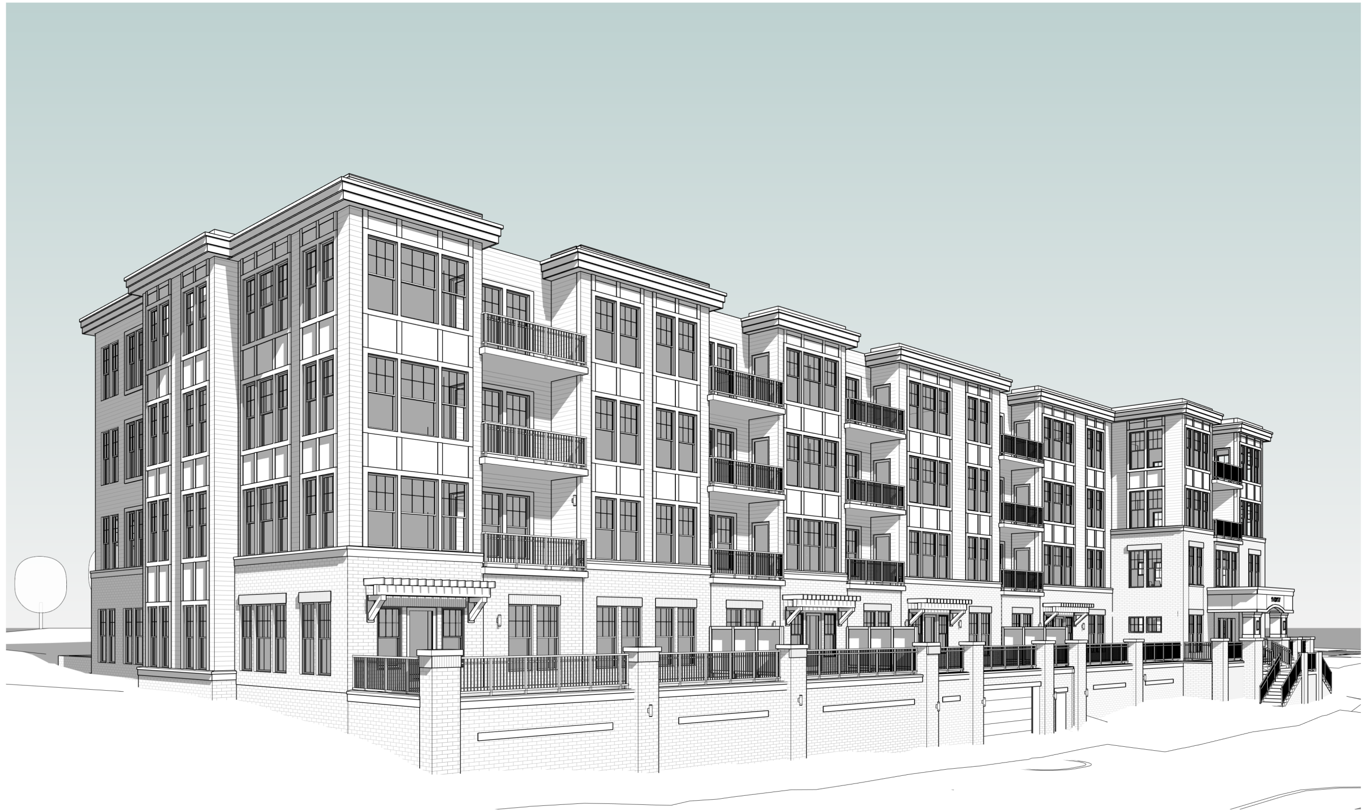
3D VIEW FROM STEWART LANE