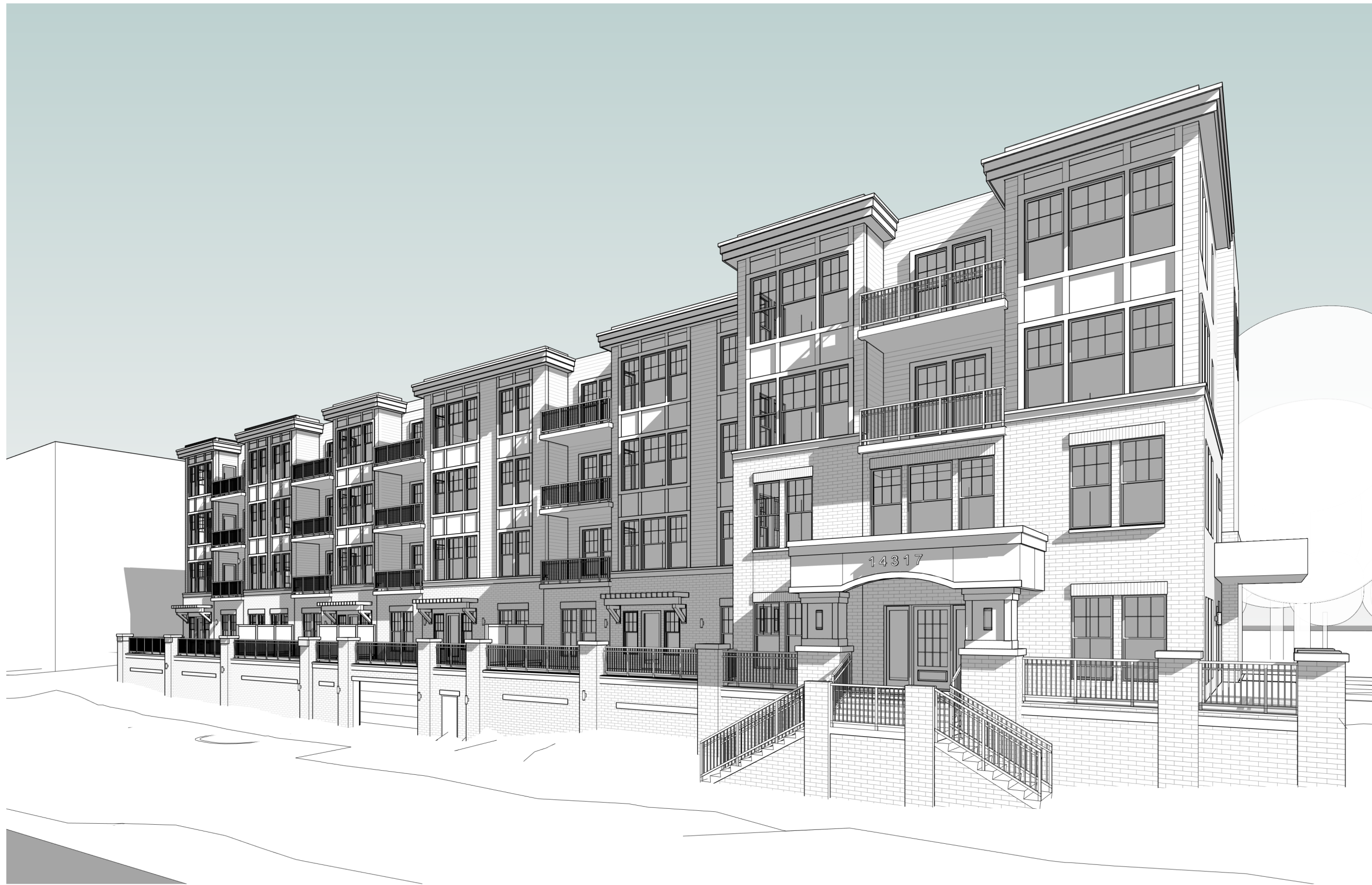
3D VIEW FROM STEWART LANE